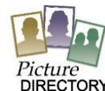
PHOTO SESSIONS FOR NEW DIRECTORY

The purpose of this Semi-Annual Planning Meeting will be to present and discuss the 2024 Plan for Ministry and proposed budget. This reviewal process provides an opportunity for your input and questions, so the Finance Committee can make any necessary adjustments for a congregational vote in January 2024.